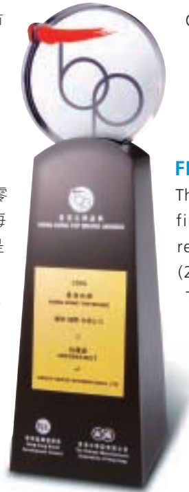
二零零六年 香港名牌：快譯通 Hong Kong Top Brand 2006: Instant-Dict

Overall, the Group will continue exploring Asian markets and developing new and innovative products, which are expected to bring in better growth momentum for the Group.